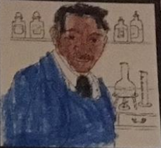
George Washington Carver