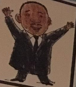
Dr. Martin Luther King Jr.